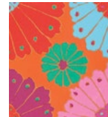
Backing 108" (274.32cm)